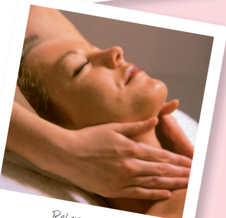
Relax with our beautiful facials