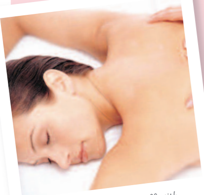
Unwind and switch off with our gorgeous body treatments