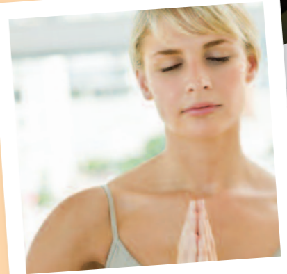
Relaxation for your mind, body and soul