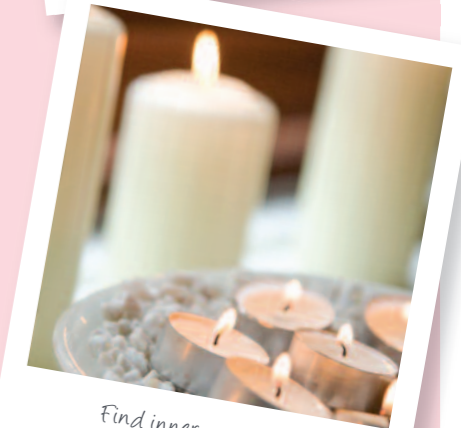
Find inner peace with our holistic therapies