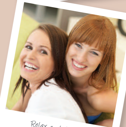
Relax and chill-out with your hens