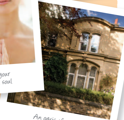
An oasis of peace and relaxation