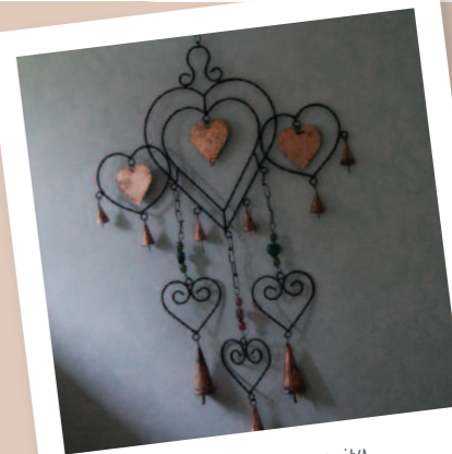
Tranquility, serenity and harmony