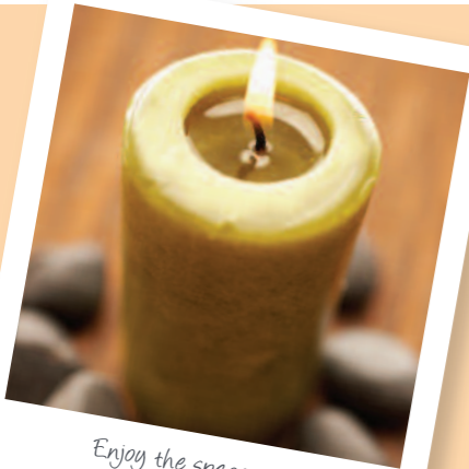
Enjoy the space and calmness of the spa